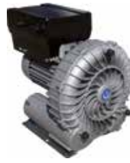
VARIAIR SV 300