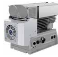
VASF 2.80 2)